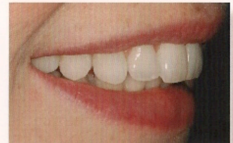
10 weeks later

"The Inman Aligner was so fast and so comfortable, I honestly couldn't believe it ... brilliant!"