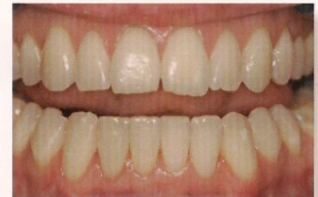
6 weeks later