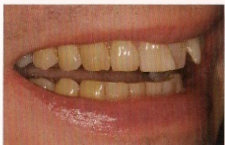
Crowded and protruding upper teeth