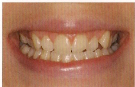
Crowded and chipped upper teeth