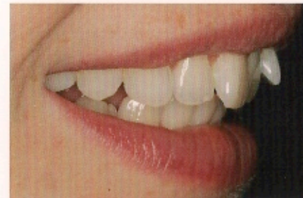
Crowded upper teeth