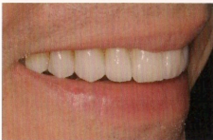
12 weeks later plus veneers