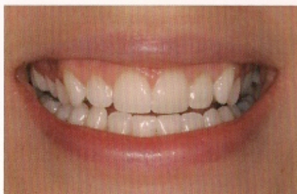
11 weeks later plus bonding