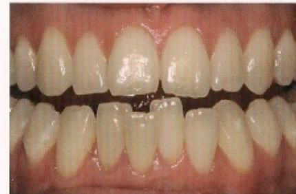
Crowded lower teeth